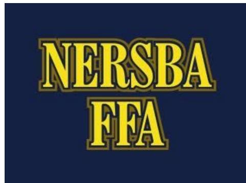
Front Left Chest